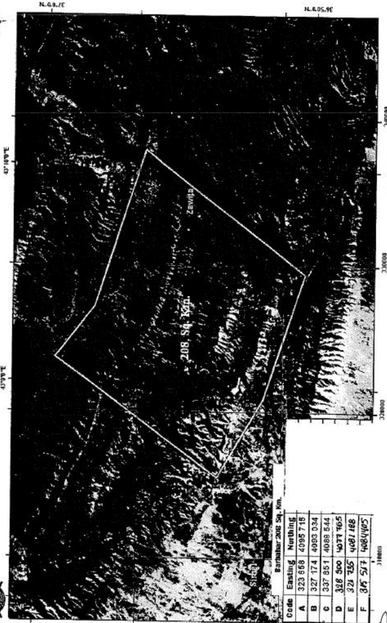
Barbahar 208 Sq. Km.